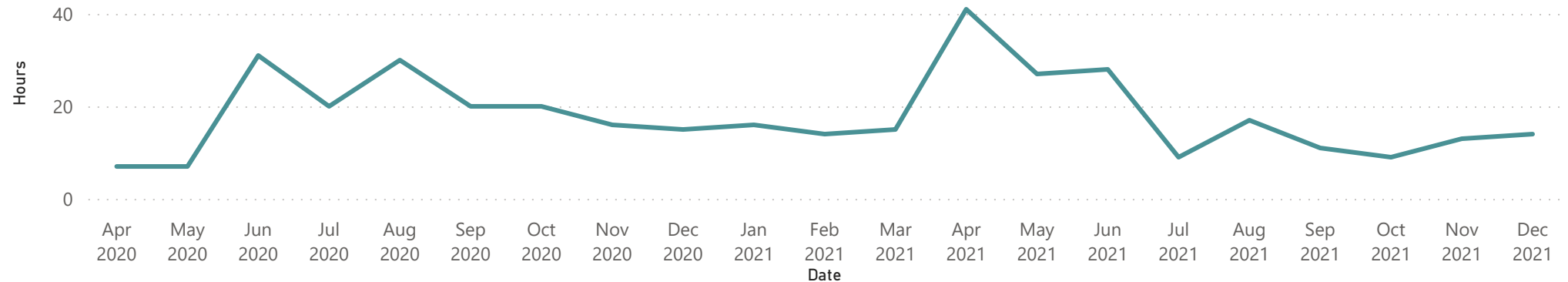
Total Non-Compliant Clock Hours