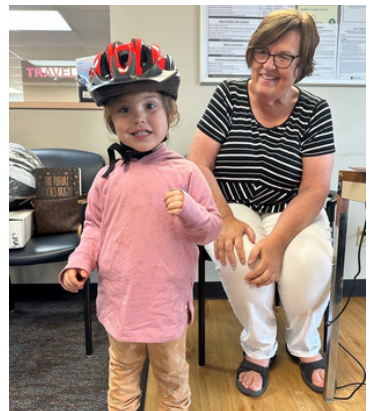
Photos in the top row include car seat check events, aggressive driving media events with District 11 Safety Press Officer and PA DUI Association Representative. The lower photos include students participating in a Trunk or Treat safety event, Highway Safety week at FedEx Corporate, and a participant of our Lawrence County Bicycle Rodeo with AAA.