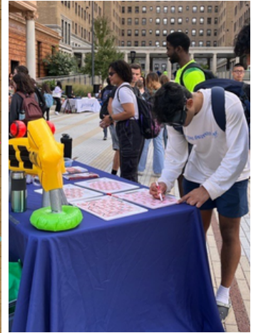
The above photos include various activities at Teen Driver Safety Expos. Students are seen enjoying the marijuana impairment maze, doing field sobriety tests with State Police Officers, and the student pledge.