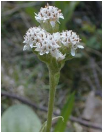
Pussytoes ( Antennaria sp )