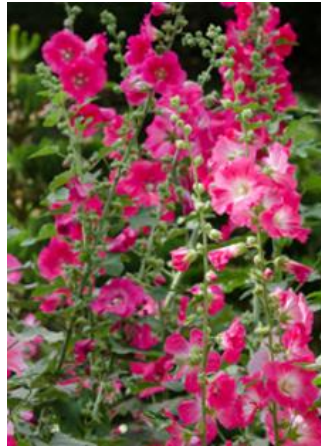
Hollyhock ( Alcea sp)