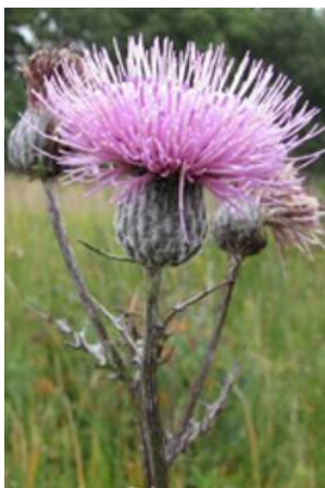
Native Thistles ( Cirsium sp )