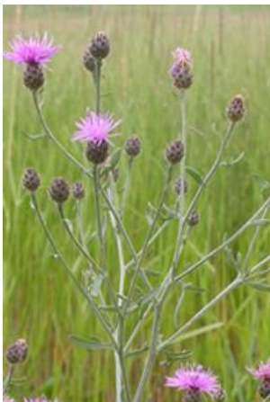
Knapweeds ( Centaurea )