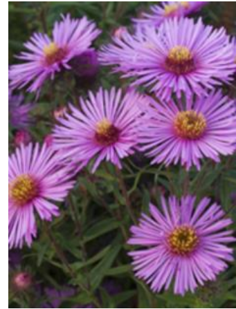
Asters ( Asteraceae )