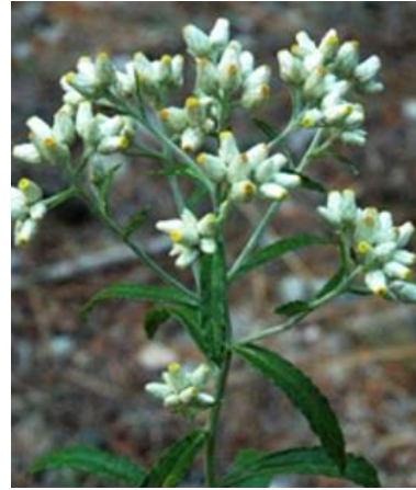
Everlasting ( Pseudognaphalium obtusifolium )