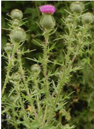
Bull Thistle (non-native Cirsium sp)