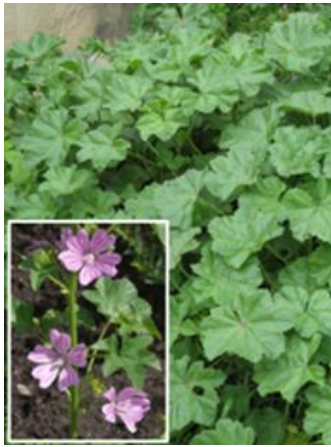
Mallows ( Malva sp)