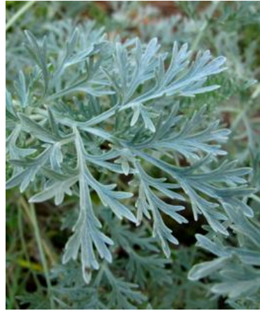
Wormwood ( Artemisia sp )