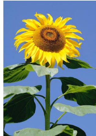
Sunflower ( Helianthus annuus )