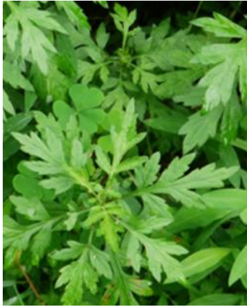
Mugwort ( Artemisia sp )