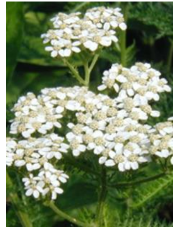
Yarrow ( Achillea millefolium )