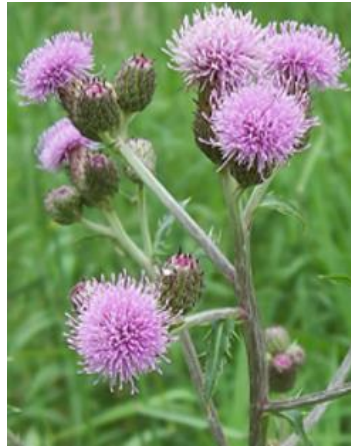
Canada Thistle (non-native Cirsium sp)