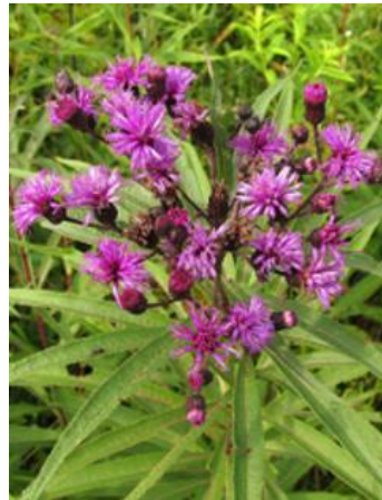
New York Ironweed ( Vernonia noveboracensis )