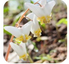
Dutchman's Breeches Dicentra cucullaria