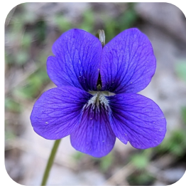
Common Blue Violet Viola sororia