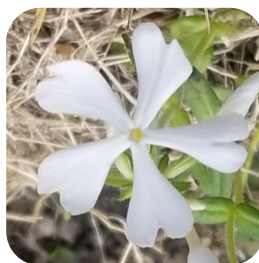
Phlox Phlox divaricata

LATODAMI NATURE CENTER NORTH PARK ♦ EST. 1969