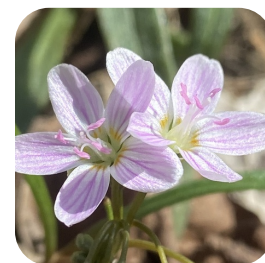
Spring Beauty Claytonia virginica

*Indicates invasive or non-native species