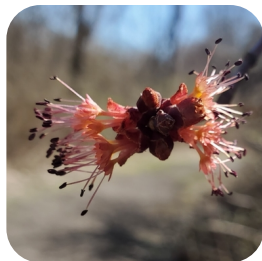
Red Maple Acer rubrum