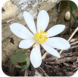
Bloodroot Sanguinaria canadensis