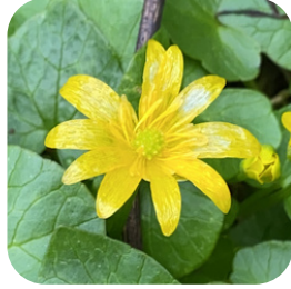
Lesser Celandine* Ficaria verna