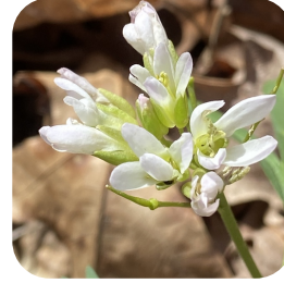
Cutleaf Toothwort Cardamine concatenata