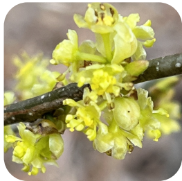
Northern Spicebush Lindera benzoin