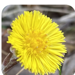
Colt's-Foot* Tussilago farfara