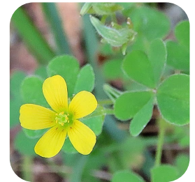
Creeping Woodsorrel Oxalis corniculata