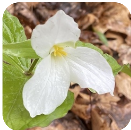
White Trillium Trillium grandifolium