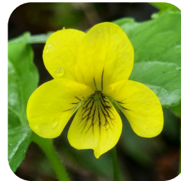
Smooth Yellow Violet Viola eriocarpa