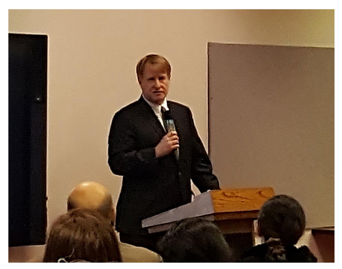
Allegheny County Executive Rich Fitzgerald