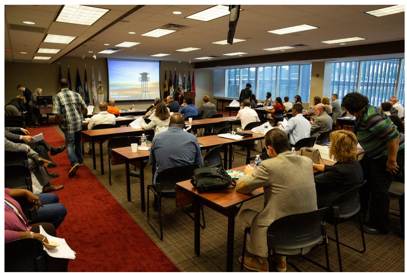
Attendees of the annual 2019 MWDBE Open House