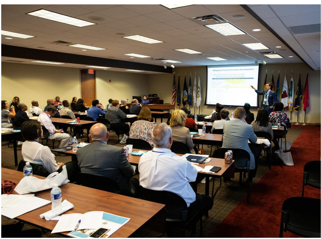
Attendees of the annual 2019 MWDBE Open House

The PA UCP, PA Women's Hall of Achievement, Center for Women's Entrepreneurship at Chatham University, Diversity Business Resource Center, Eastern Minority Supplier Development Council, Pittsburgh Metropolitan Hispanic Chamber of Commerce, African American Chamber of Commerce of Western PA, NAACP, National Association of Women Business Owners, National Urban League, Southwestern PA Engineering Outreach, MWDBE Governmental Committee, National Council of Negro Women, Mon Yough Chamber of Commerce and American Contract Compliance Association.