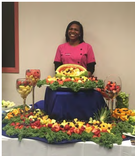
Catering was provided by PA UCP- certified firm Roxanne's Catering