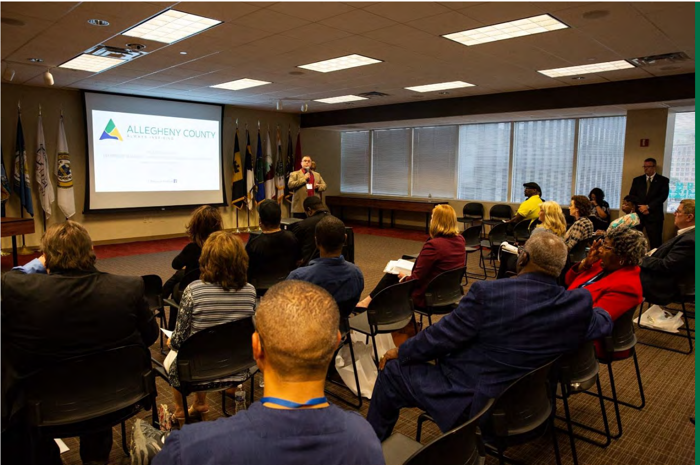
2018 MWDBE Open House