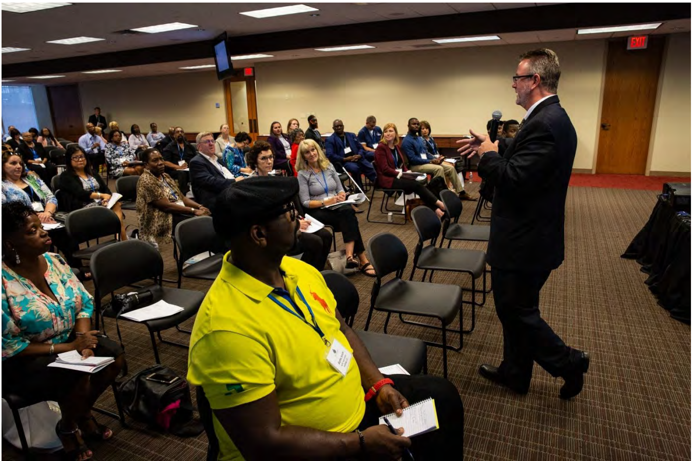
Attendees of the annual 2018 MWDBE Open House

The Department maintains active membership in organizations that inform its mission including: the PA Unified Certification Program, National Association of Diverse Contractors, PA Women's Hall of Achievement, Center for Women's Entrepreneurship at Chatham University, Diversity Business Resource Center, Eastern Minority Supplier Development Council, Pittsburgh Metropolitan Hispanic Chamber of Commerce, African American Chamber of Commerce of Western PA, NAACP, National Association of Women Business Owners, National Urban League, Southwestern PA Engineering Outreach, MWDBE Governmental Committee, National Council of Negro Women, Inc., Mon Yough Chamber of Commerce, and American Contract Compliance Association.