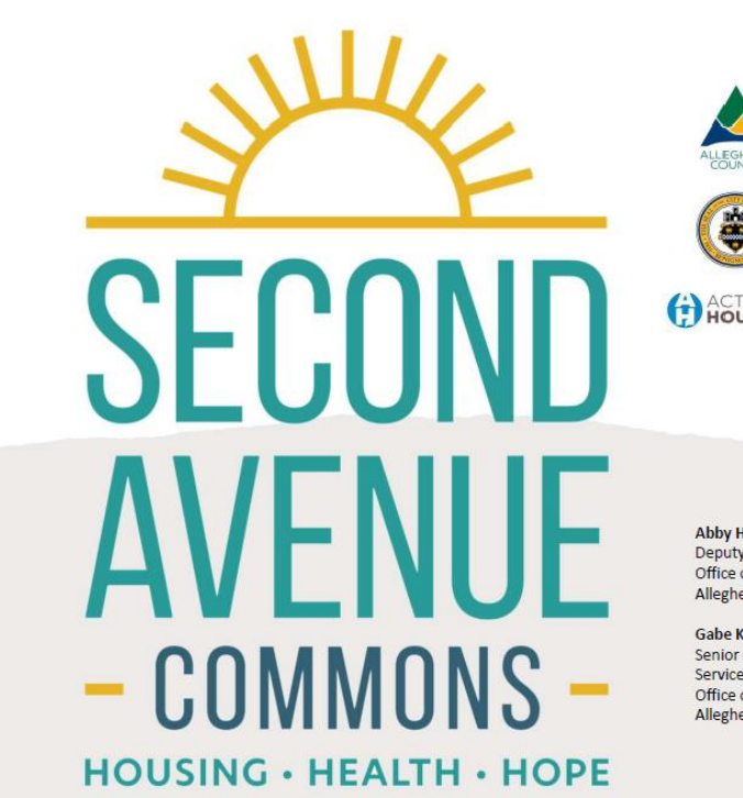
Appendix A Second Avenue Commons