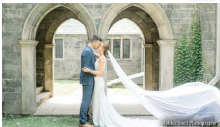
Ashlea Snell Photography

Our wedding was held at the Stables at Hartwood Acres and it was PERFECT. Such a beautiful and unique space. The grounds make you feel as though you've been transported into some type [of] fairytale land! Will forever hold a special place in my heart!"