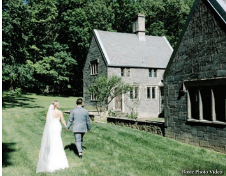
Rosie Photo Video