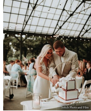
Solich Photo and Film