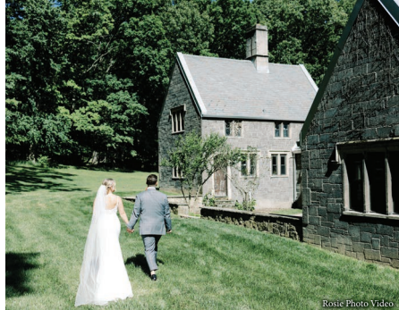
Rosie Photo Video