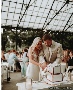
Solich Photo and Film