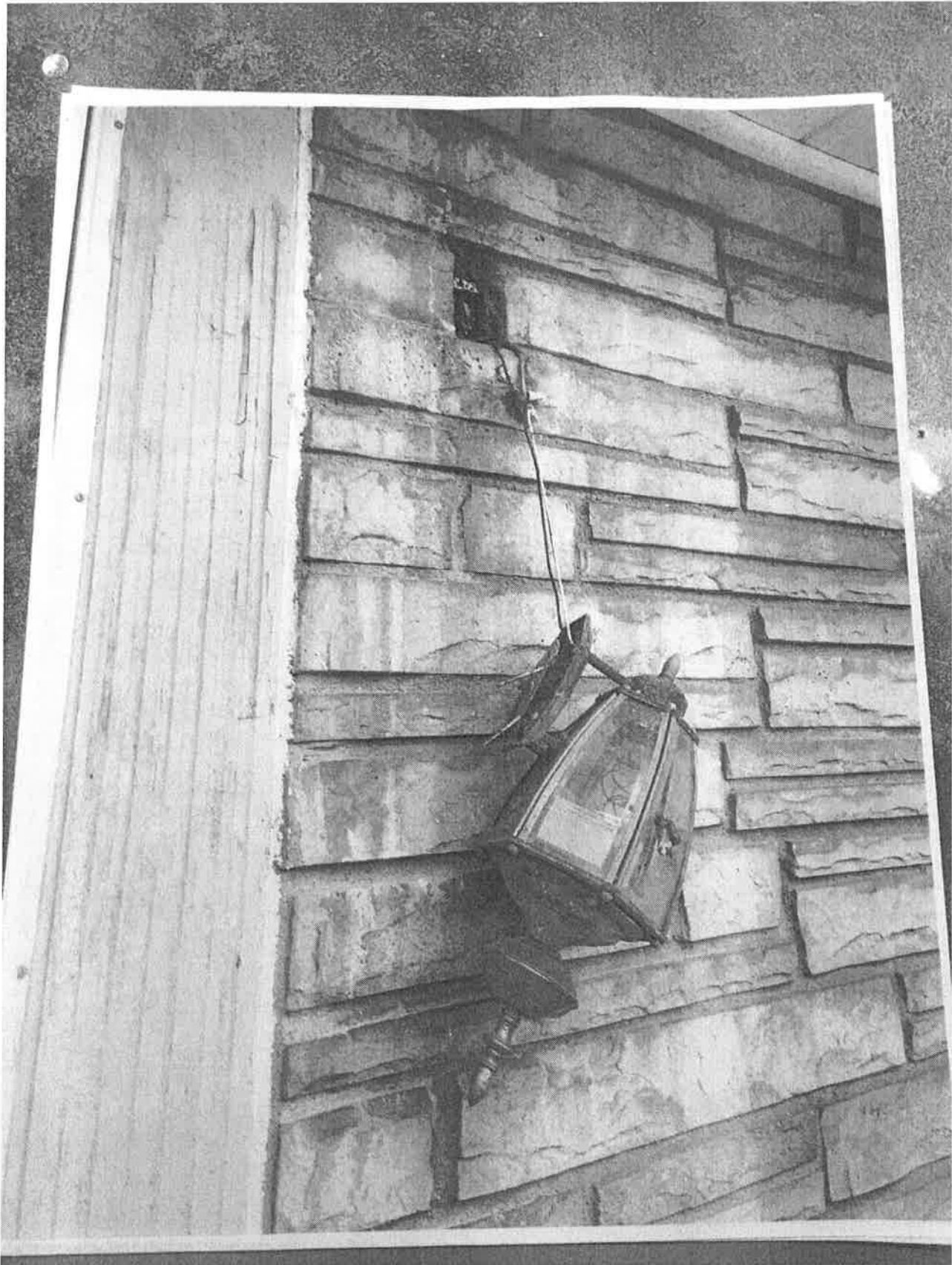
Unnecessary damage, that is everywhere