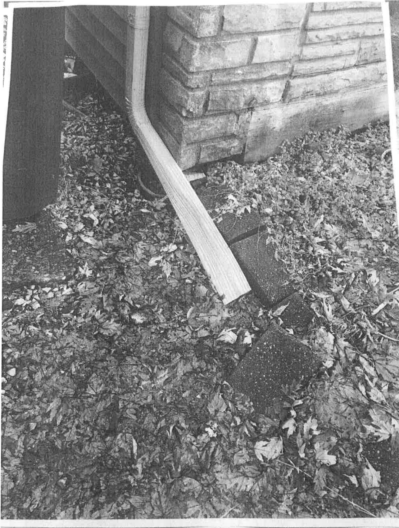
Missing and crushed downspouts.