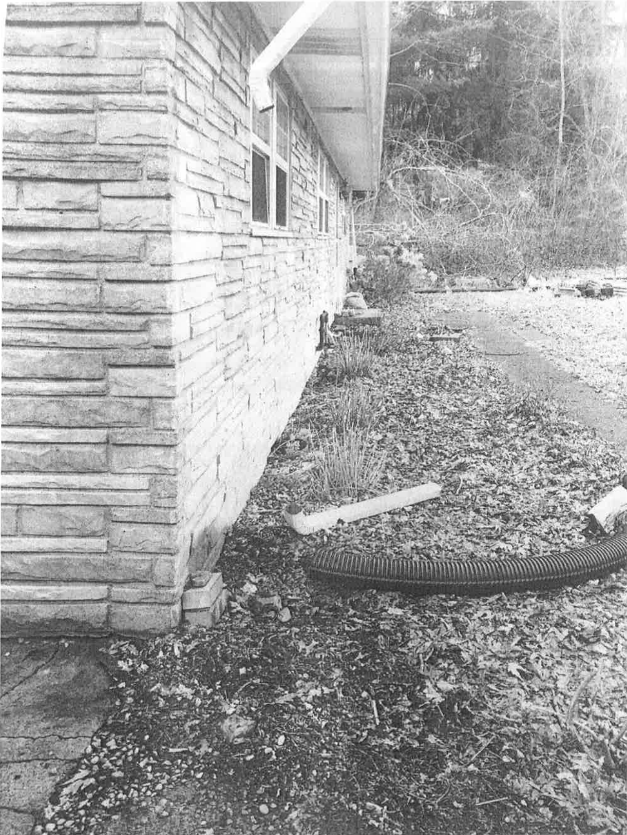
This is where you walk into the house. Can't miss that it's not attached